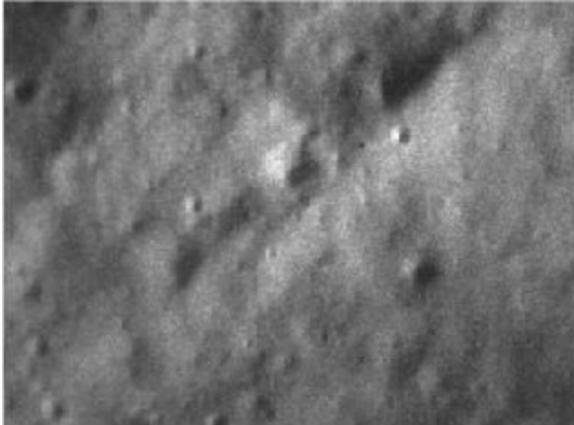
Fig. 1. The ruin-like formation near the lunar crater Lovelace photographed by the space probe Clementine on March 8, 1994 (image LHD 30055.080). This cluster of rectangular depressions occupied an area of about 13km 2 .